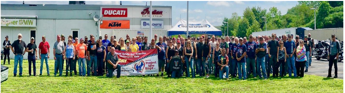
Photo Highlights 2018 - Project New Hope Inc.